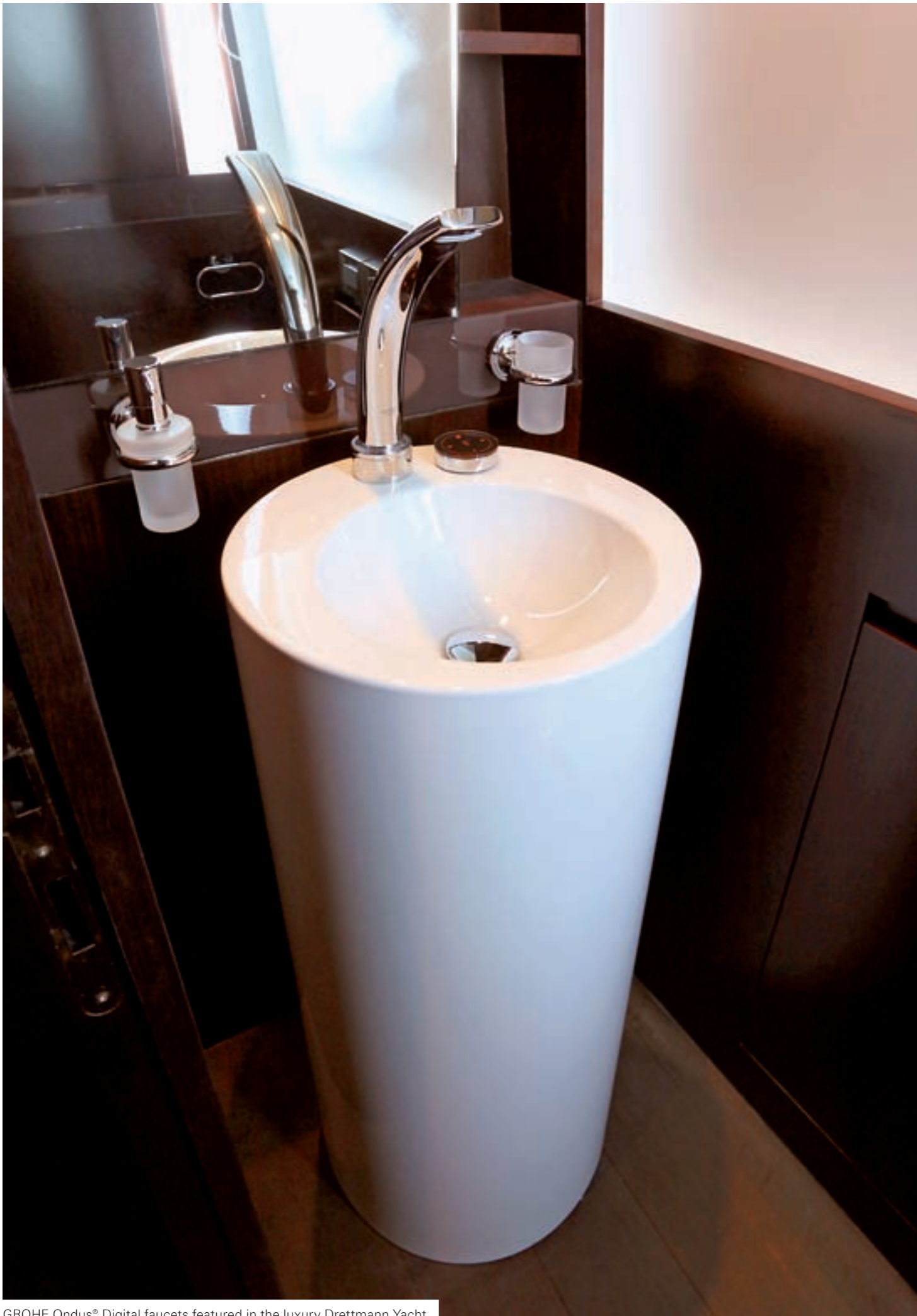
GROHE Ondus® Digital faucets featured in the luxury Drettmann Yacht