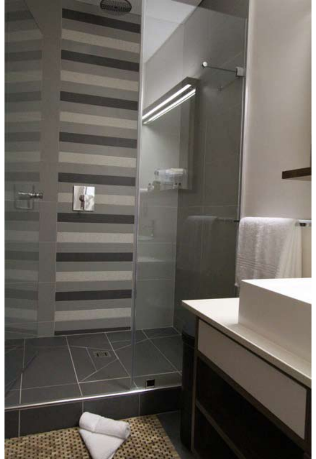
The elegance of Allure can be seen throughout the Square Boutique Hotel & Spa

We chose the Allure range, due to the contemporary design, comfort and slick square finish. We also loved the rain shower effect from the silicone nozzles from the GROHE Rainshower.